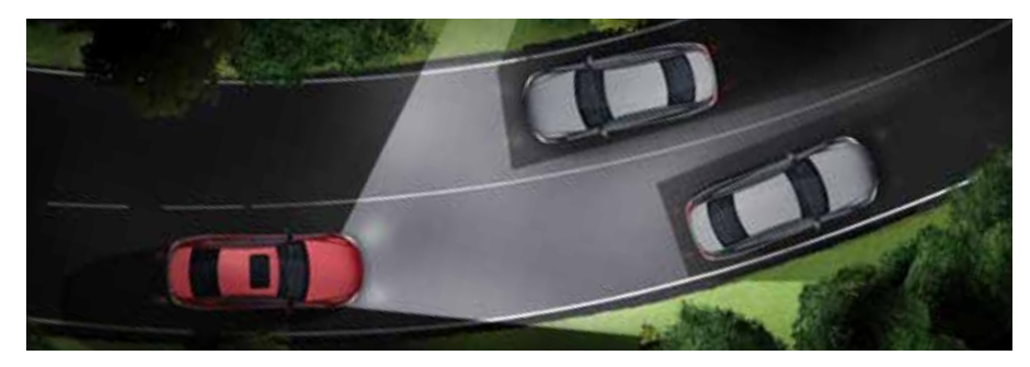
The MULTIBEAM LED headlamps react quickly to the current road and traffic conditions with individually controllable LEDs. The partial main beam masks out other road users detected; when the road ahead is clear, ULTRA RANGE Highbeam switches to permanent long-range illumination of the carriageway.