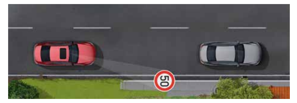
Active Speed Limit Assist adopts speed limits detected by camera or known to the navigation system as the new set speed for Active Distance Assist DISTRONIC.